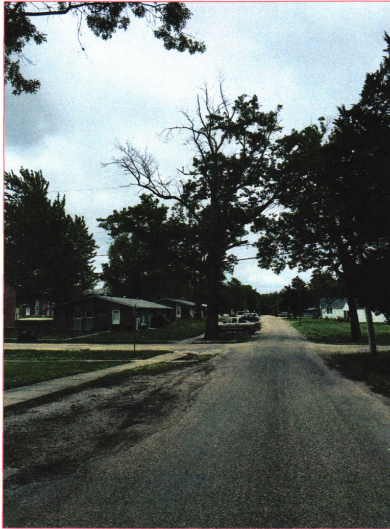
TREE — NE corner of N. Dawley & E. Lyford St., Salem, IL